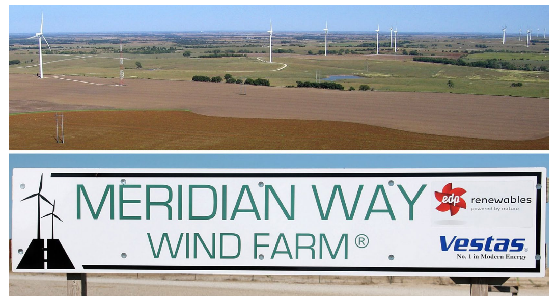
Figure 4. Meridian Way Wind Farm is situated on the Blue Hills escarpment in Cloud County, north-central Kansas. Above – total of 67 Vestas V90 3.0-MW turbines have a nomimal generating capacity of 201 MW. Meteorologic tower to left records wind and other weather factors for analysis of turbine performance. Below – International character of the wind industry in Kansas. Vestas, the world's largest maker of wind turbines, is based in Denmark, and EDPR, among the largest operators of wind farms, is based in Spain.

in the High Plains and Blue Hills (Fig. 4). Existing wind farms were expanded and many new wind farms developed in these regions. Among the newest projects in western Kansas is the Alexander Wind Farm completed in 2015 in the Blue Hills region (KEIN 2016). It has 33 Siemens turbines with a nominal generating capacity of 48 MW (Fig. 5). Originally developed by OwnEnergy, it was acquired by New Jersey Resources. The Kansas City Board of Public Utilities bought 25 MW and Yahoo Inc. purchased the remaining production.