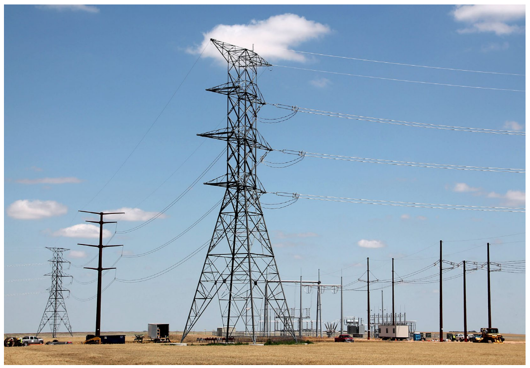
Figure 2. New transmission line and substation under construction to serve the wind-energy complex surrounding Spearville near Dodge City, Kansas. This vicinity of the High Plains has the greatest concentration of wind farms in Kansas.

The term windscape refers to all those factors related to development of wind energy (Aber et al. 2015). A quick scan of Tables 2 and 3 reveals that windscape conditions in the United States are generally best in the Great Plains and Midwest regions. This is where the best wind resources are found spread across extensive, sparsely populated, rural, mostly prairie or agricultural terrain. This windscape region reaches from western Indiana to eastern Colorado and from Texas to North Dakota. Across vast areas, average wind speed generally exceeds 7 m/sec at 80 m height and in the best locations is greater than 8 m/sec (WINDExchange 2016).