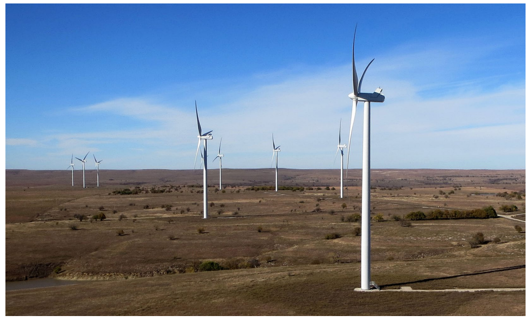
Figure 6. Caney River Wind Farm is situated on a prominent escarpment of the Americus Limestone in western Elk County. The Flint Hills crest is visible on the western horizon. Vestas V90 turbines; the towers are 80 tall, and the blades are 44 m long. The fin on the nacelle is for cooling purposes. This wind farm includes 111 turbines with a nominal generating capacity of 200 MW.

Much research has been conducted on turbine noise, and regulations for wind farms exist particularly in Europe. The U.S. Occupational Safety and Health Administration has established limits for sound in the workplace (OSHA 2016). Field testing has shown that most turbines generate sound in the ~300-1250 Hz range (Oerlemans 2011), which is well below the high frequency that poses greatest danger for human hearing. Most of the noise from turbines is generated by the trailing edge of the blade. Methods to reduce trailing-edge noise include optimized airfoil shape, swept blades, and serrations or brushes along the trailing edge of the blade (Fig. 8).