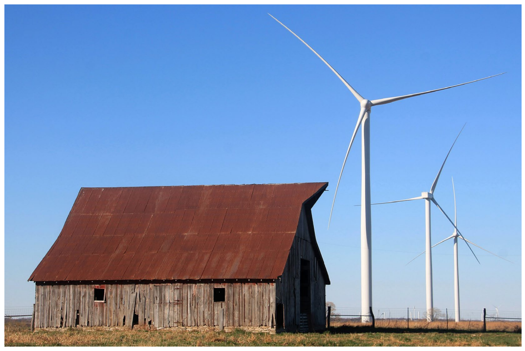
Figure 7. Ad Astra Wind Farm in the Osage Cuestas near Waverly, Kansas. New Gamesa G114 2.0-MW turbines from Spain. A total of 95 turbines would provide a nominal generating capacity of 190 MW. Turbines were assembled but not yet operating in this view. The traditional barn provides a striking contrast with modern turbines. This wind farm is operated by EDP Renewables, also from Spain.

Species of particular concern in Kansas include greater and lesser prairie-chickens (Tympanuchus cupido and T. pallidicinctus respectively). Optimal prairie-chicken habitat consists of intact tallgrass prairie free of woody encroachment with prescribed burning roughly once every third year (Obermeyer et al. 2011). Since presettlement time, prairie-chicken populations have declined substantially as a result of habitat loss and changes in land use. In 2014 the U.S. Fish and Wildlife Service listed lesser prairie-chicken as an endangered species (USFWS 2014). However, the lesser prairie-chicken was removed from the list officially in 2016 following a 2015 court order in Texas (USFWS 2016). Multi-year investigation has shown surprisingly that prairiechickens are not adversely affected by wind farms; in fact, female survival rates increased after wind turbines were installed at the Meridian Way Wind Power Facility in north-central Kansas (Sandercock 2013).