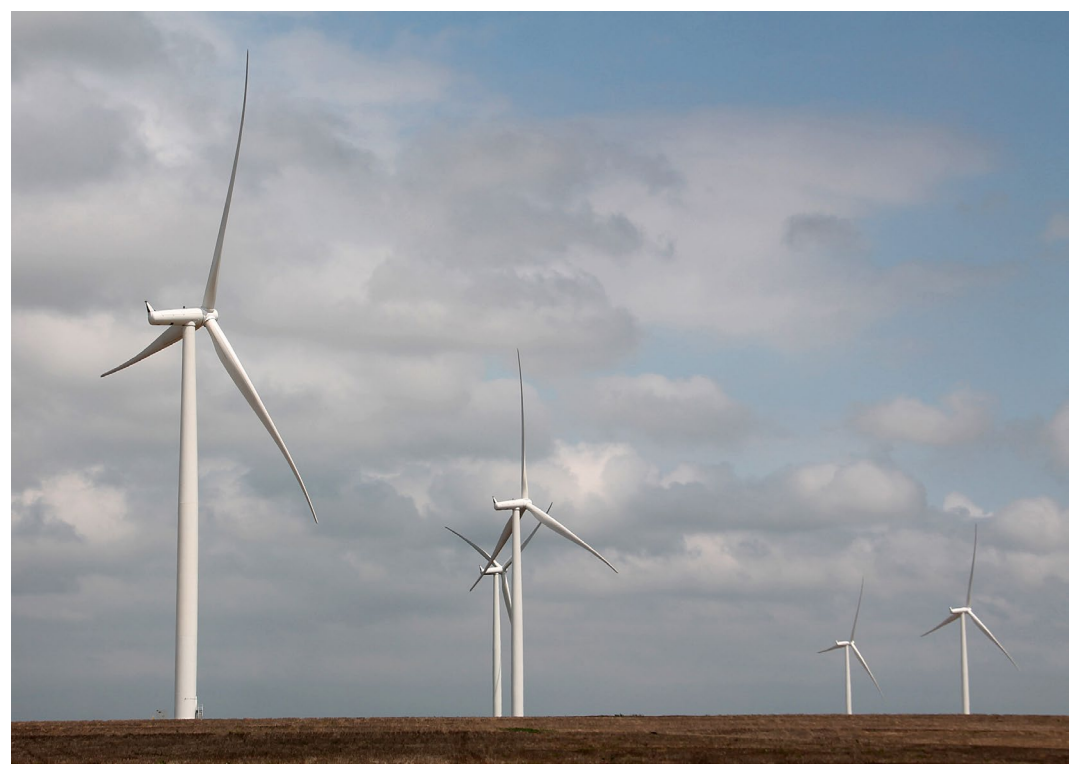
Figure 5. Siemens turbines in a portion of the Alexander Wind Farm, Rush County. Components of these turbines were manufactured presumably at the Siemens factory in Hutchinson. Siemens is a descendent of Danregn and Bonus, both early Danish makers of wind turbines in the 1980s.

average wind speed at 80 m height). The Ad Astra Wind Farm is the first large wind project east of the Flint Hills in the state (Fig. 7). The wind-power industry in Kansas has reached a mature status in which large wind projects are populated by scores of turbines with more-orless standard design features and dimensions, as the previous examples demonstrate. In addition to this wind-power infrastructure, Kansas consumers now have the option to purchase all or part of their electricity from renewable (wind or solar) sources for a small surcharge. Westar Energy, for instance, predicts that by the end of 2017, one-third of its retail energy would come from the wind (Westar 2016).