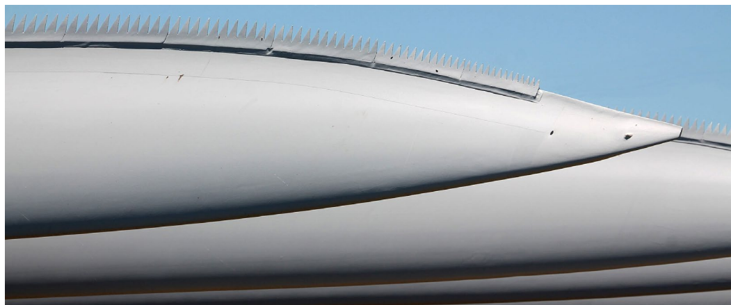
Figure 8. Serrated edges on blade tips for GE turbines. Seen here in the BNFS Railway storage depot at Garden City, Kansas. To the authors' knowledge, few blades of this type are deployed in Kansas wind farms.

Rapid increase of atmospheric CO 2 and its potential global warming impact are major environmental issues of general concern worldwide. From a pre-industrial level of ~280 ppm, global mean atmospheric CO 2 concentration exceeded 400 ppm in 2015 and continues to increase (NOAA 2016). This level already has surpassed the presumed tipping point of 350 ppm, beyond which uncertain or irreversible environmental consequences may take place (Foley 2010). Developing safe and renewable energy resources that have minimal environmental impacts is a priority for humanity in the twenty-first century (Aber et al. 2015). Wind energy from Kansas is part of the solution; diverse energy sources must be integrated into a production and delivery system in which the strengths of each type offset weaknesses for other types.