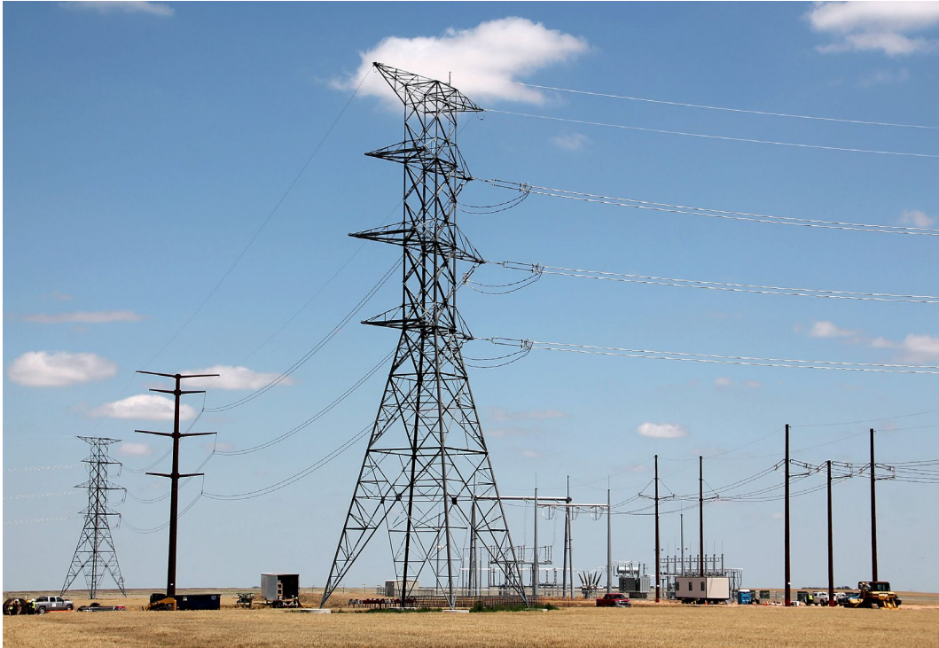
Figure 2. New transmission line and substation under construction to serve the wind-energy complex surrounding Spearville near Dodge City, Kansas. This vicinity of the High Plains has the greatest concentration of wind farms in Kansas.

The term windscape refers to all those factors related to development of wind energy (Aber et al. 2015). A quick scan of Tables 2 and 3 reveals that windscape conditions in the United States are generally best in the Great Plains and Midwest regions. This is where the best wind resources are found spread across extensive, sparsely populated, rural, mostly prairie or agricultural terrain. This windscape region reaches from western Indiana to eastern Colorado and from Texas to North Dakota. Across vast areas, average wind speed generally exceeds 7 m/sec at 80 m height and in the best locations is greater than 8 m/sec (WINDEXchange 2016).