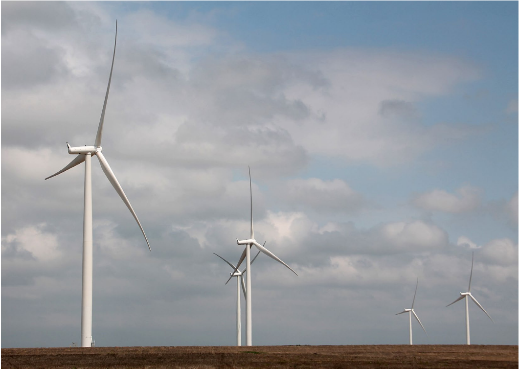
Figure 5. Siemens turbines in a portion of the Alexander Wind Farm, Rush County. Components of these turbines were manufactured presumably at the Siemens factory in Hutchinson. Siemens is a descendent of Danregn and Bonus, both early Danish makers of wind turbines in the 1980s.

average wind speed at 80 m height). The Ad Astra Wind Farm is the first large wind project east of the Flint Hills in the state (Fig. 7). The wind-power industry in Kansas has reached a mature status in which large wind projects are populated by scores of turbines with more-or-less standard design features and dimensions, as the previous examples demonstrate. In addition to this wind-power infrastructure, Kansas consumers now have the option to purchase all or part of their electricity from renewable (wind or solar) sources for a small surcharge. Westar Energy, for instance, predicts that by the end of 2017, one-third of its retail energy would come from the wind (Westar 2016).