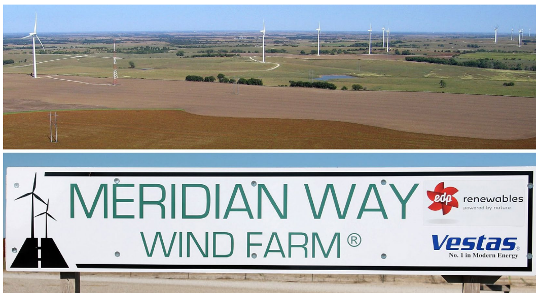
Figure 4. Meridian Way Wind Farm is situated on the Blue Hills escarpment in Cloud County, north-central Kansas. Above – total of 67 Vestas V90 3.0-MW turbines have a nominal generating capacity of 201 MW. Meteorologic tower to left records wind and other weather factors for analysis of turbine performance. Below – International character of the wind industry in Kansas. Vestas, the world's largest maker of wind turbines, is based in Denmark, and EDPR, among the largest operators of wind farms, is based in Spain.

in the High Plains and Blue Hills (Fig. 4). Existing wind farms were expanded and many new wind farms developed in these regions. Among the newest projects in western Kansas is the Alexander Wind Farm completed in 2015 in the Blue Hills region (KEIN 2016). It has 33 Siemens turbines with a nominal generating capacity of 48 MW (Fig. 5). Originally developed by OwnEnergy, it was acquired by New Jersey Resources. The Kansas City Board of Public Utilities bought 25 MW and Yahoo Inc. purchased the remaining production.