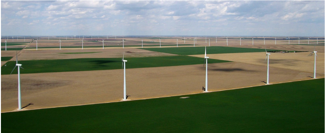
Figure 1. Gray County Wind Farm was the first large wind-energy development in Kansas in 2001. It contains 170 Vestas V47 turbines with a combined capacity of 112 MW. By current standards, these are relatively small turbines that are closely spaced. Fields with winter wheat (green) alternate with fallow fields (brown) in this spring view.

nearly one-quarter of electricity needs for Kansas, which ranks the state third in the nation for per-capita wind energy (Table 3). Turbines in Kansas wind farms were manufactured in Denmark, India, Spain, and the United States (KEIN 2016), and Siemens built a turbine