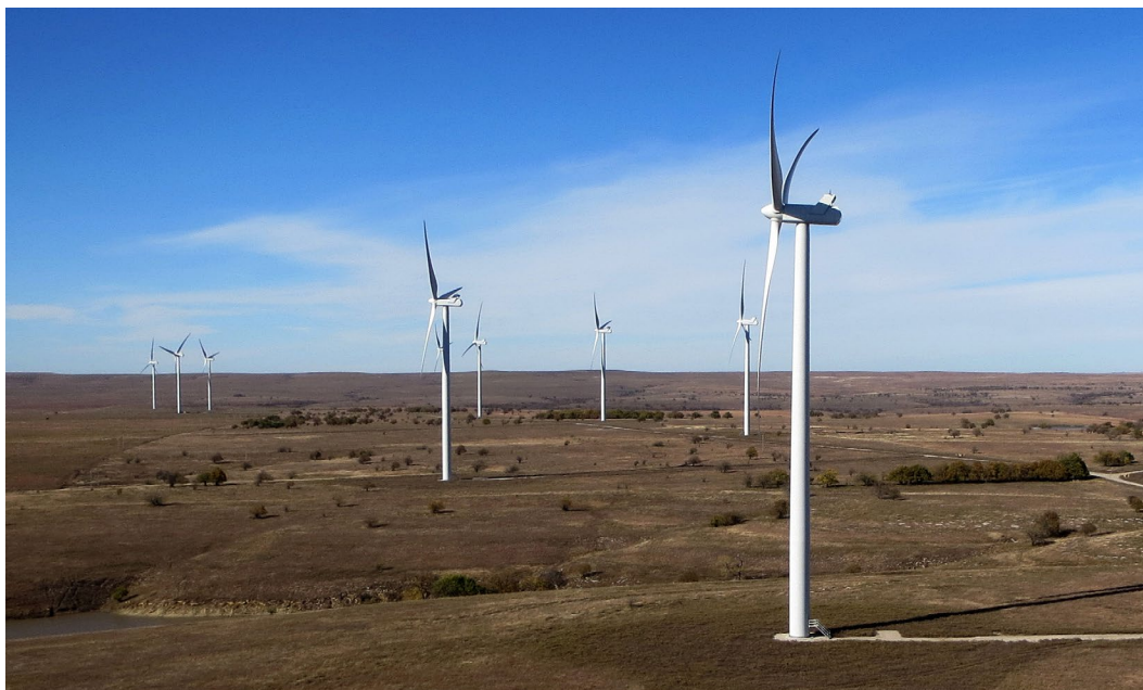
Figure 6. Caney River Wind Farm is situated on a prominent escarpment of the Americus Limestone in western Elk County. The Flint Hills crest is visible on the western horizon. Vestas V90 turbines; the towers are 80 tall, and the blades are 44 m long. The fin on the nacelle is for cooling purposes. This wind farm includes 111 turbines with a nominal generating capacity of 200 MW.

Much research has been conducted on turbine noise, and regulations for wind farms exist particularly in Europe. The U.S. Occupational Safety and Health Administration has established limits for sound in the workplace (OSHA 2016). Field testing has shown that most turbines generate sound in the ~300-1250 Hz range (Oerlemans 2011), which is well below the high frequency that poses greatest danger for human hearing. Most of the noise from turbines is generated by the trailing edge of the blade. Methods to reduce trailing-edge noise include optimized airfoil shape, swept blades, and serrations or brushes along the trailing edge of the blade (Fig. 8).