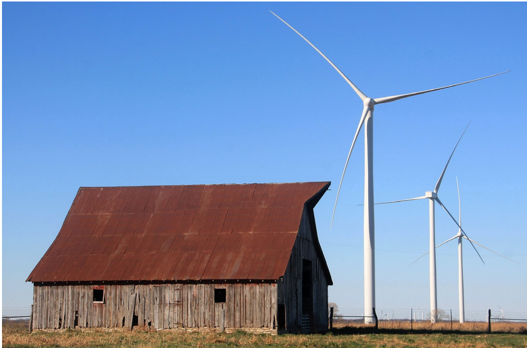
Figure 7. Ad Astra Wind Farm in the Osage Cuestas near Waverly, Kansas. New Gamesa G114 2.0-MW turbines from Spain. A total of 95 turbines would provide a nominal generating capacity of 190 MW. Turbines were assembled but not yet operating in this view. The traditional barn provides a striking contrast with modern turbines. This wind farm is operated by EDP Renewables, also from Spain.

Species of particular concern in Kansas include greater and lesser prairie-chickens ( Tympanuchus cupido and T. pallidicinctus respectively). Optimal prairie-chicken habitat consists of intact tallgrass prairie free of woody encroachment with prescribed burning roughly once every third year (Obermeyer et al. 2011). Since pre-settlement time, prairie-chicken populations have declined substantially as a result of habitat loss and changes in land use. In 2014 the U.S. Fish and Wildlife Service listed lesser prairie-chicken as an endangered species (USFWS 2014). However, the lesser prairie-chicken was removed from the list officially in 2016 following a 2015 court order in Texas (USFWS 2016). Multi-year investigation has shown surprisingly that prairie-chickens are not adversely affected by wind farms; in fact, female survival rates increased after wind turbines were installed at the Meridian Way Wind Power Facility in north-central Kansas (Sandercock 2013).